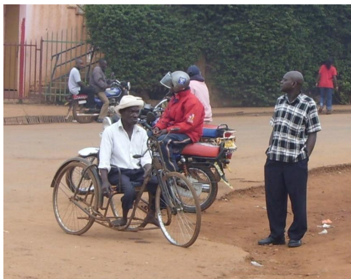
Taken in Kampala by myself November 2011